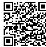
GOOGLE PLAY STORE

2 SEARCH FOR THE EVENT. Return to your device's home screen and open the app. Depending on the event's security settings, enter the event name or event ID in the search bar. The event name is "Optometry's Meeting® 2022".